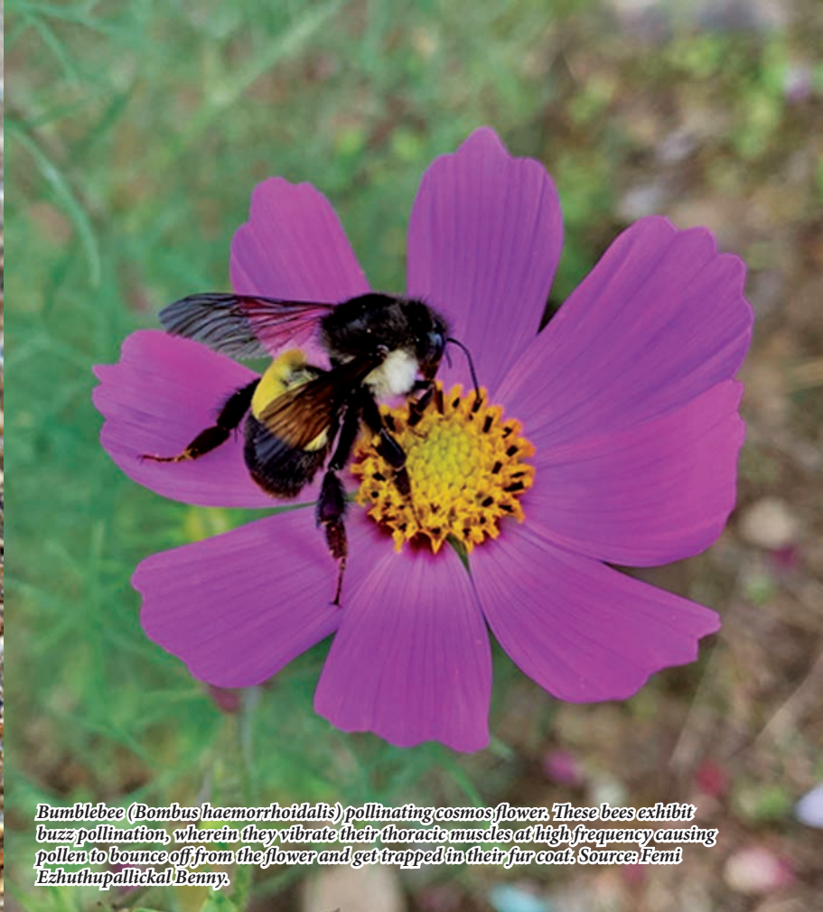
Bumblebee (Bombus haemorrhoidalis) pollinating cosmos flower. These bees exhibit buzz pollination, wherein they vibrate their thoracic muscles at high frequency causing pollen to bounce off from the flower and get trapped in their fur coat.

recyclers and decomposers, breaking down organic matter and thereby replenishing nutrients in the soil, bolstering the health of ecosystems worldwide. For example, in the 1800s, European settlers introduced cattle to Australia, but the absence of native dung beetles in Australia, capable of processing cattle dung led to dung accumulation, increased parasitic infections, and economic losses in the cattle industry. To address this, scientists introduced dung beetle species from Africa and Europe in the mid-20th century, which effectively decomposed the cattle dung, thereby improving soil fertility, reduced parasite and pest populations, and boosted the cattle industry's productivity. This historical event is one of the several testaments to the ecological role of dung beetles and the broader role insects play in maintaining ecosystem health. The role of insects as predators and parasitoids of agricultural pests, and thus preventing yield loss are also not widely acknowledged.