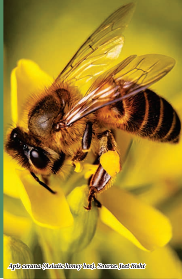
Apis cerana (Asiatic honey bee).

Growing up in a small village in Kerala, we were closely connected to nature and taught to appreciate all living things, including insects. However, not all insects were treated equally. A vivid memory is the appearance of alates (winged termite swarms) at the onset of monsoon, especially after the first showers. Alates would swarm around lights at night, often falling into our kanji (a rice porridge staple). As children, we found this disgusting and demanded the dish be replaced. Now, as an entomologist, I understand that alates are clean, emerging after first showers only to mate and then die. Recently, after the summer showers in Bengaluru, I was having tea and fried snacks when an alate fell onto my plate. I simply picked them out and continued eating. The tea shop owner offered to replace my plate, but I proudly declined, knowing it was not a big deal. Now that’s what awareness and proper education about insects has done to me- a vicissitude in perception!