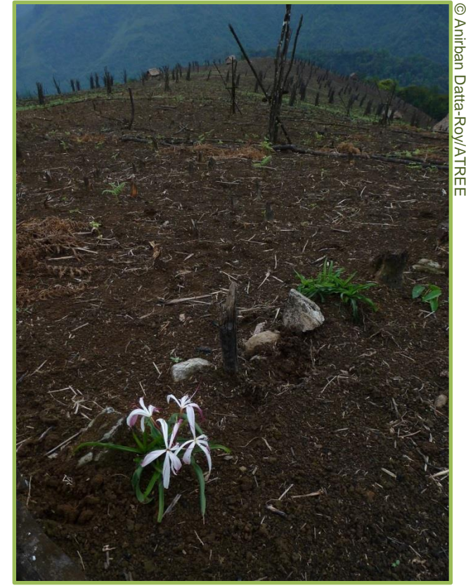
Crinum amoenum, used to mark boundaries of shifting agriculture fields .

Bomdo is located close to the Siang, and the river skirts the village owing to the terrain. In late April, eight species of cuckoos call constantly, often two or three calls overlapping, like cuckoo clocks that need no rewinding. This time of year, the shifting cultivation landscape around the village features tiny patches of lilies flowering at the boundaries of individually owned patches. This is a sign for the Adi to sow rice. But the importance of this bloom goes beyond ornamenting the farm or signalling rice planting time.