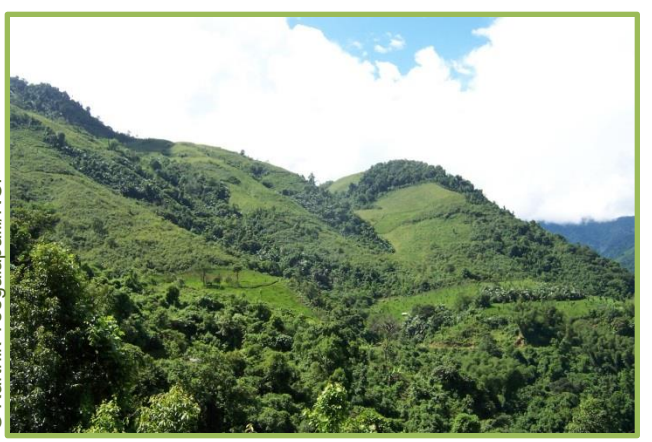
The landscape around Bomdo village.

Crinum amoenum is used by the Adi to demarcate individual plots within a larger shifting cultivation mosaic. The plant is fire-hardy, slow-growing and propagates through tubers. It is locally called riksu sodok , meaning 'boundary ground orchid', and is used to resolve boundary issues between shifting cultivators. The size of individual plant tubers indicates when it was planted and how old the patch is, or who it belongs to. In the past, the Kebang (traditional Adi institution) has resolved patch ownership issues based on the location and age of this plant in the field.