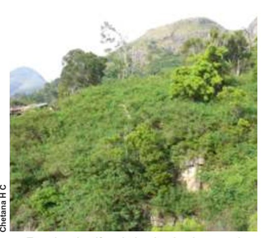
Tea plant itself took the dominating stand in a 19 year old abandoned tea plantation

In the mid-1800s, many large plantations were established at the expense of natural forest in many parts of India. The British and the subsequent Indian government leased these plantations out to private developers on a long-term basis, usually for a period of 99 years or less. In recent times, many such plantations surrounded by forests have been