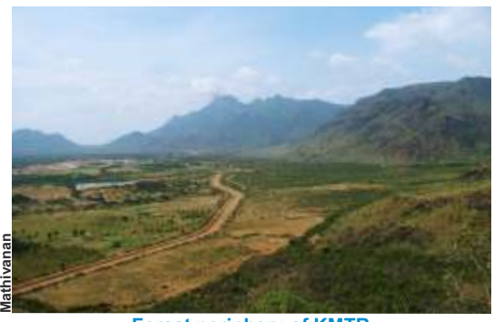
Forest periphery of KMTR

Most protected areas in India have a 'buffer' around them where ecologically harmful developmental activities are curtailed. There are enough laws and rules that attempt to make sure that this buffer exists. However developmental, political and economic pressures are violating and amending these rules on a regular basis and KMTR is no exception. We explore how important is the buffer or Ecologically; Sensitive Zones (ESZ) as it is now called, for KMTR. Within 5 Kms from the forest boundary of KMTR there are many granite quarries, spinning mills and chemical industries while newer unregulated developments like real estates, private farms and monoculture tree plantations are escalating. So what do these mean to KMTR and biodiversity in general? The areas where granite quarries are located provided important habitats for several species of animals that are useful for agriculture, such