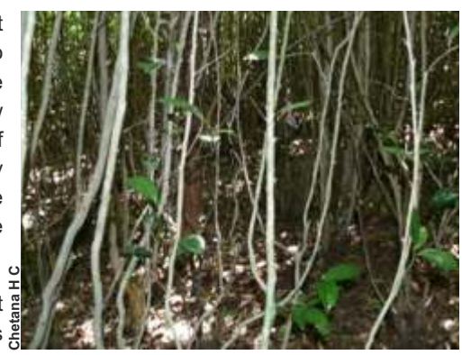
Abandoned tea plantation with over grown Lantana camara

Following abandonment, if a plantation is left unmanaged and undisturbed, it experiences different colonization patterns depending on its location. Many invasive species colonize the plantations at different elevations in the Agasthyamalai hills. At the elevational range of 900-1000 metres above sea level, Lantana camara took over about 60 to 70 % of the area in a 19-year-old abandoned plantation (photo 1). A similar trend has been observed even in recently (7 years old) abandoned plantation in Ponmudi (Kerala) with many invasive species such as Eupatorium sp. Cromolaena odorata and Lantana camara overgrown in the 600 to 1000 meters elevation range. Many studies have highlighted that invasive species lead to