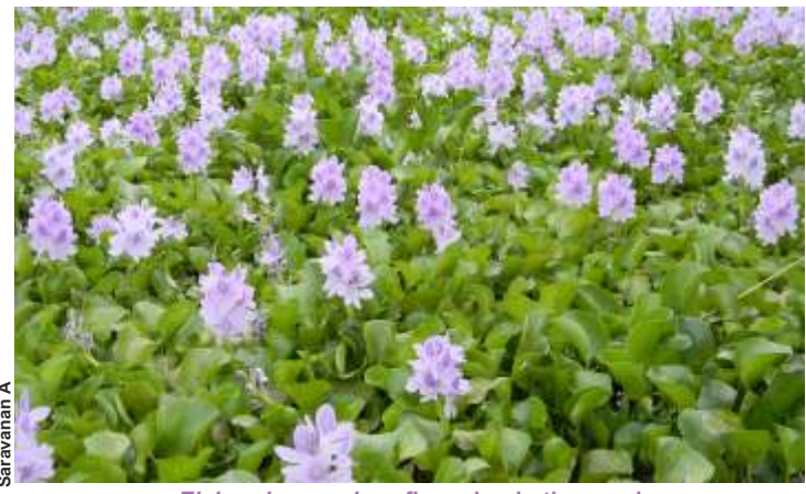
Eicharnia crassipes flowering in the pond

away either. As these plants store mineral traces from the polluted water in addition to carbon and nitrogen, they are being used as green manure. Further, since they bind well with clay in the form of silt they can be useful for farming. Nowadays water hyacinth is also used as raw material in paper industry and for making furniture by local communities. Several possibilities have been explored in using Aagayathamarai as a source for biomass-based energy generation by researchers, though it has not been commercialized. On the other hand, Alternanthera philoxeroides is used as fodder especially by buffalo which feed