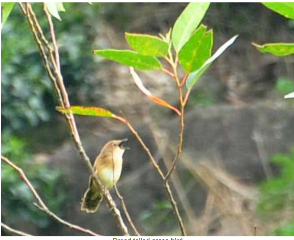
Broad tailed grass bird

I had on one earlier occasion, seen a pair of grassbirds in the Muthukuzhi area although they were obscured by grasses. This sighting was clear and is etched in my memory. For the next couple of days, we would regularly hear the bird from the same place. The bird possibly had its nest in the sedges and from literature I came to know that the nest remains water-tight through the monsoon.