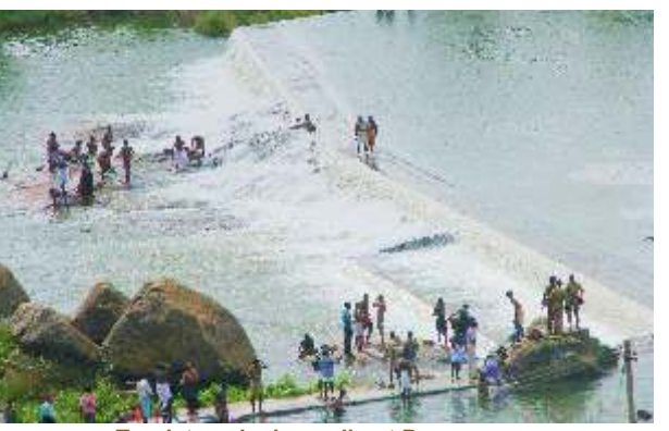
Tourists enjoying a dip at Papanasam

Recently however, a ruling by the Supreme Court of India has threatened to take away