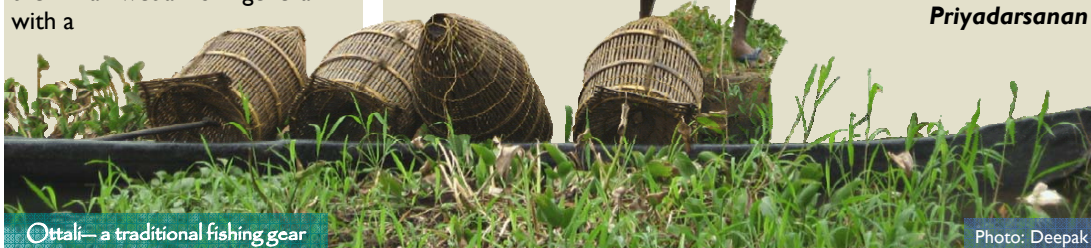
Ottali - a traditional fishing gear