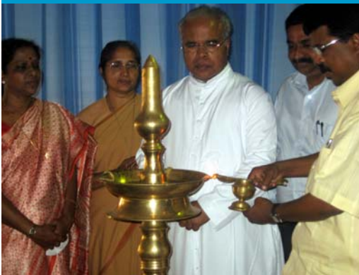
Inauguration of Wetland Festival-2008