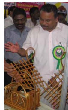
Kerala Minister for Agriculture, Mr. Mullakara Ratnakaran appreciate Lantana products at Farmfest—2008

Recent boom of wetland tourism bring profits to those associated with it, but the resultant ecological degradation affects several traditional stakeholders