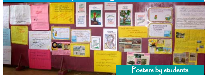
Posters by students