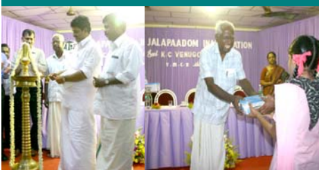
Jalapaadom was inaugurated on October 4th, 2007