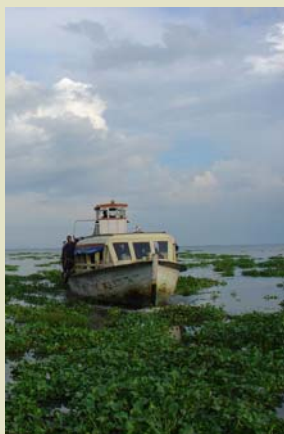
Vembanad—Kol wetland is the largest Ramsar site in India.

Every living creature needs clean and safe drinking water. One of the major challenges of humanity today is to balance increasing demands for fresh water and integrity of fresh-water biodiversity and aquatic environment. More than 1/3 rd of the humanity today is living without adequate fresh water and forecasts state that two thirds of the World population will be without safe drinking water by the year 2025.