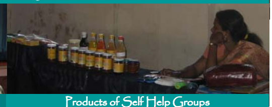
Products of Self Help Groups