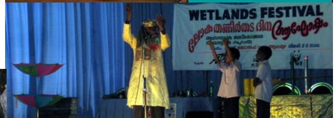
Magic Show on 'Water and Wetlands'