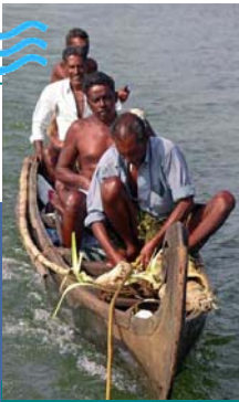
Health of the wetlands is critical to the survival of fishermen

"The fertile lands once called 'the rice bowl of Kerala' is slowly getting its name as a 'waste bowl of Kerala'."