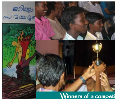
Winners of a competition