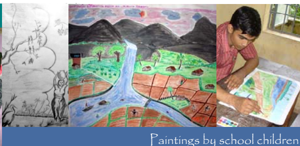
Paintings by school children