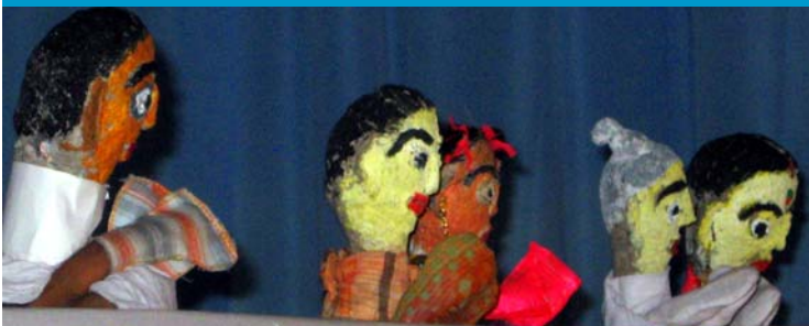
Puppet Show on Wetland Conservation

A puppet show with wetland conservation as the theme was an attraction of the Wetland Festival. Conceived, created and performed by members of Wetland study Center, Govt. TTI Alappuzha, the story centered on the environmental deterioration of the Vembanad socio-ecological system. The 15 minutes show was successful in highlighting the deterioration of the lake and affected livelihoods. Puppet show as a strong and interesting media inspire us to organize further workshops on puppet making/show for the students to propagate conservation message. The puppet show concluded stating that there are chances of hope as long as we have dedicated organizations like ATREE.